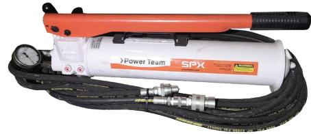
HYDRAULIC HAND PUMP

The Stressing Jack is supplied with the appropriate Jack Jaws for the cable strand.