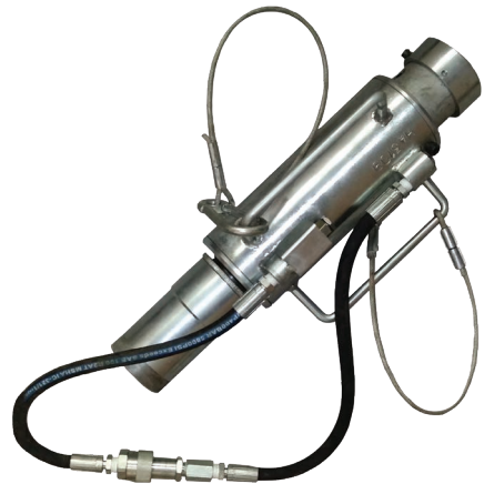
HYDRAULIC CABLE CROPPER

Including Jack Jaws equipped with safety sling