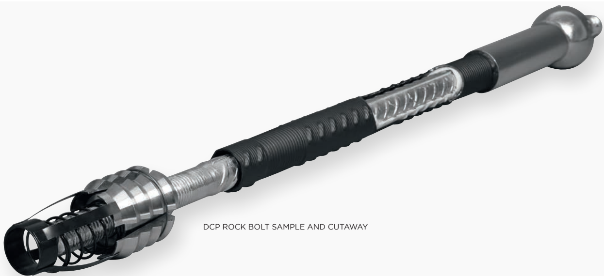
DCP ROCK BOLT SAMPLE AND CUTAWAY